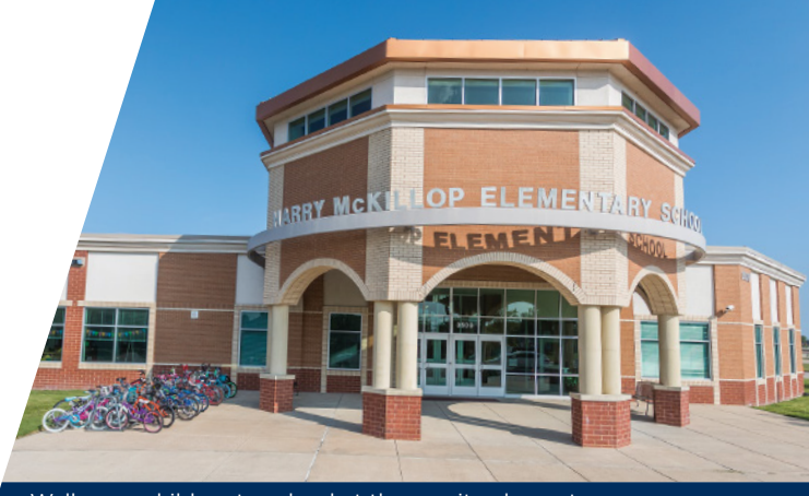
Walk your children to school at the on-site elementary

Located in the highly regarded Melissa Independent School District, homeowners with children will enjoy access to a first-class education and Liberty's on-site primary school, Harry McKillop Elementary. Parents will also appreciate The Academy, a before-and-afterschool program for students K-5 conveniently held on the campus of Harry McKillop Elementary.